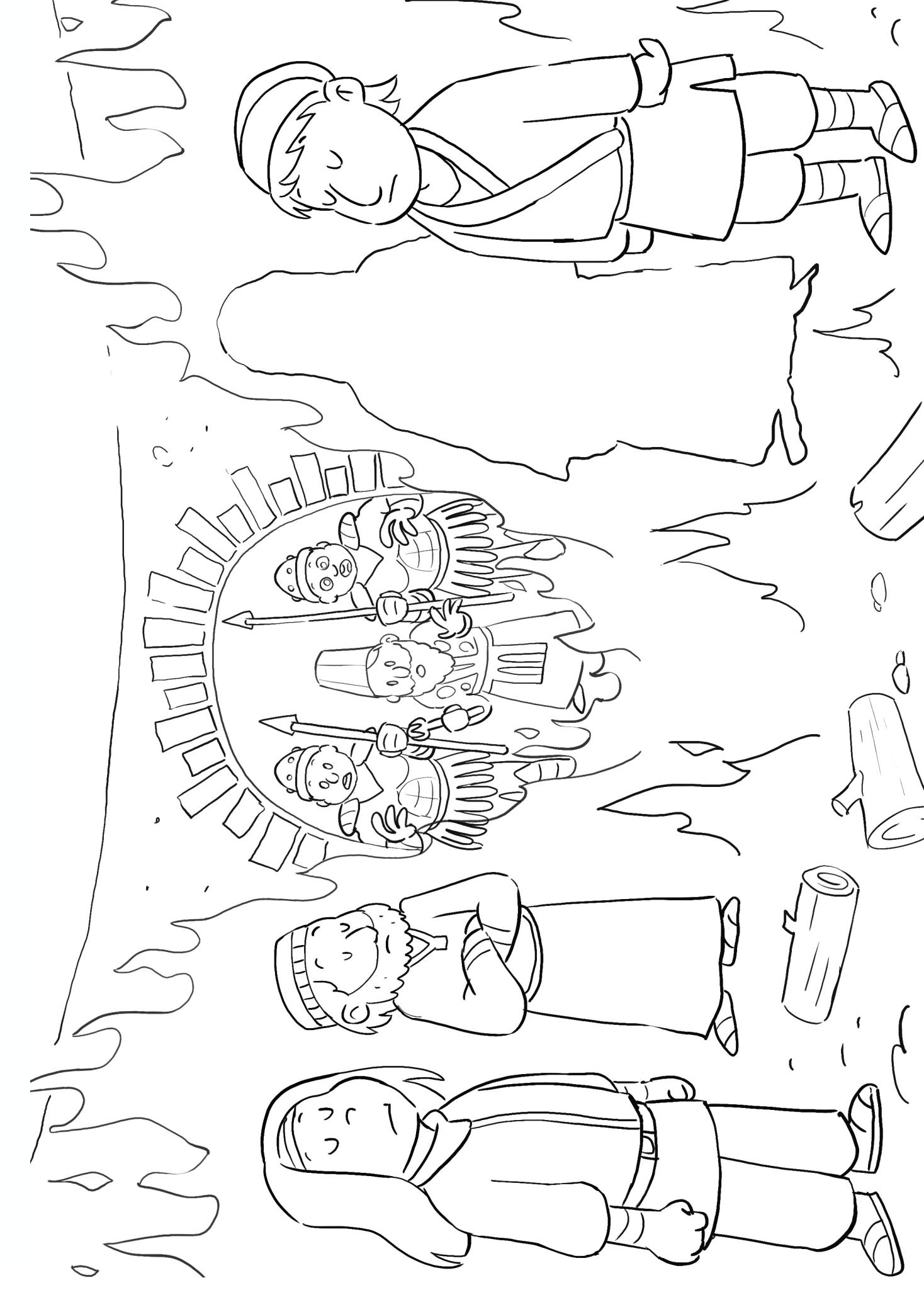
WEEK 2 • COLORING PAGE • Grow Curriculum and Annual Strategy (Volume 6) @2022 Stuff You Can Use. All rights reserved. www.stuffyoucanuse.org